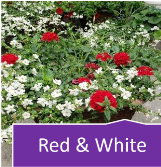
Red & White

These decorative square pulp pots measure 12" by 13" at the top and 11" tall. They are potted with a variety of sun loving plants, but will also do fine in partial sun. The color combinations are listed below. We only made a few of each of these this year to see how they would sell. So, quantities are limited. If you would like to order one, we will have them laid out at pick up so you can pick the one you like. Plants: dracaena , bacopa , ivy geraniums , petunias , verbena calibrachoa , potato vine , trixiliners