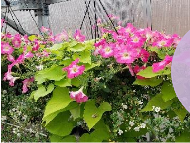
German Style Green

All of these baskets are sun loving basket combinations. Many are combinations that we have planted in the past and some are new varieties based on customer feedback. You will order these by their name in the online order form. Plants: Mixmaster varieties, bacopa, wave petunias, petchoa, verbenas, calibrachoa, potato vine.