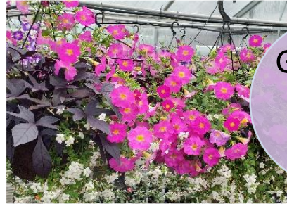
German Style Purple