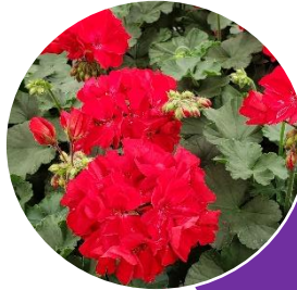
Fantasia Dk Red