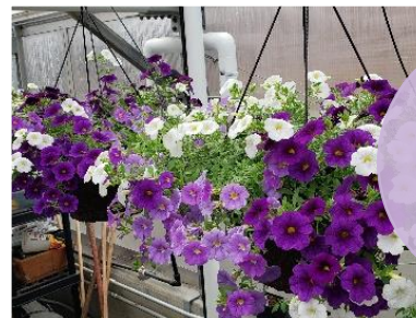
Purple with a Purpose