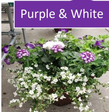
Purple & White