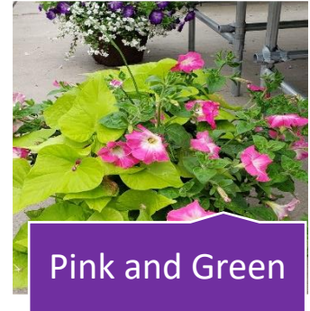
Pink and Green