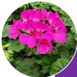
Ivy Geranium Purple