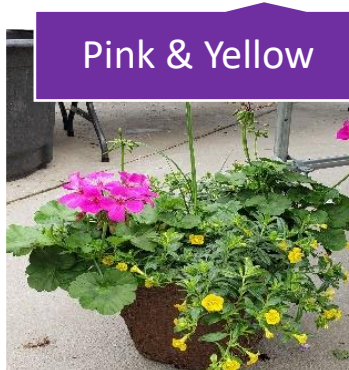
Pink & Yellow