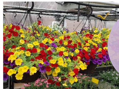
Sprinkles on Top