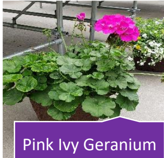
Pink Ivy Geranium