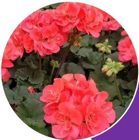
Fantasia Flamingo Rose